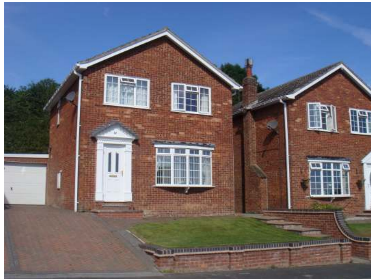
14 PARK RISE, HUNMANBY, NORTH YORKSHIRE, YO14 0NJ

An elevated detached property located within the popular village of Hunmanby. The accommodation has had a considerable ground floor extension creating a well laid out family home. The accommodation is well presented throughout and comprises of: Lounge with dining/ study off. Large modern Dining kitchen with French doors leading to garden. There is also a Wc and access to the double sized garage from the ground floor. To the first floor are three bedrooms and bathroom with separate shower cubicle. Outside the property to the front is a garden being laid mainly to lawn and block paved drive leading up to the garage, accessed via electric door and remote. To the rear of the property is a nicely landscaped garden with lawn, water feature and Indian stone seating area. The property comes gas heated and double glazed with potential to convert the garage to further accommodation if required. At the rear of the property there is a conservation area.